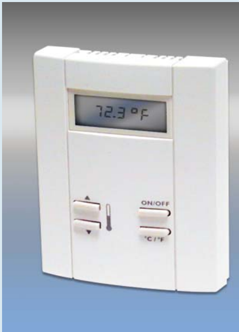
Andover Smart Sensor