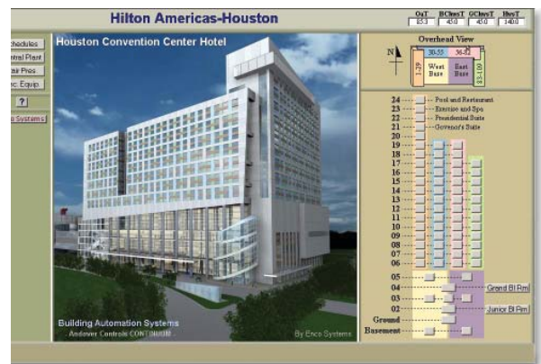
CyberStation workstation home screen

“Enco created a user-friendly graphical screen for us to schedule temperature and lighting for the hotel’s meeting rooms each morning. CyberStation also provides my staff with real-time information on each space in the hotel and the equipment that services it. Alarms are routed both to the workstation and our Nextel phones, so we can take the appropriate action quickly. We are still fine-tuning the system, but already I feel like we have unlimited capabilities!”